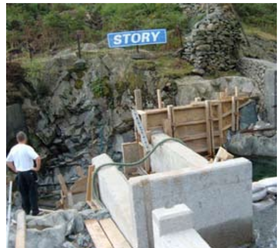
Further developments during construction of intake