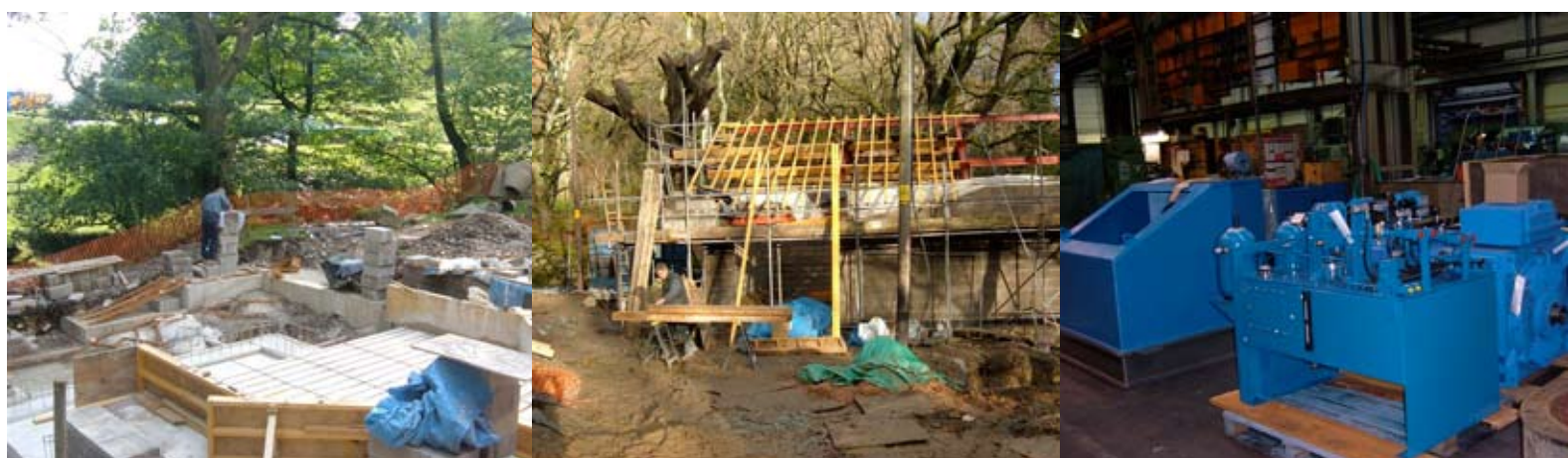
Powerhouse construction and turbine during manufacture