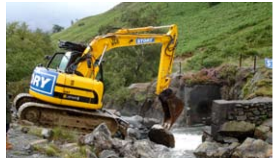
Work starting on intake